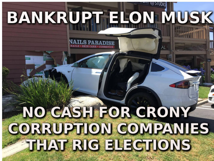
Tesla's out-of-control sudden-acceleration surge defects and exploding batteries are not as bad as Tesla's out-of-control corruption and bribery.

ELON MUSK'S PAID-FOR FAKE NEWS MEDIA SHILLS. THEY COVER UP HIS CORRUPTION AND PUSH PUFF-STORIES ABOUT MUSK. NEVER TRUST THEM TO BE ANYTHING BUT BIASED PROPAGANDA OUTLETS. MANY OF THEM OWN TESLA STOCK: Electrek, Google, Facebook, CNN, Huffington Post, Dianne Feinstein's PR office, Nancy Pelosi, Steven Chu, MSNBC, PayPal, KPXX-TV, San Jose Mercury News, Any Hearst owned entity, The SF Chronicle, Motley Fool, Green Car Congress, The executive staff of the DNC, The NY Times,